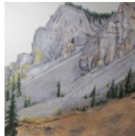
Leona Busse Yellowstone Mountains